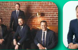
Down East Boys