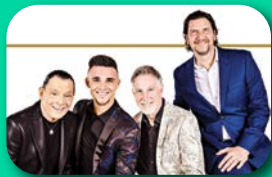
Carolina the Band