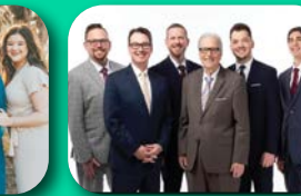
The Matthews Family