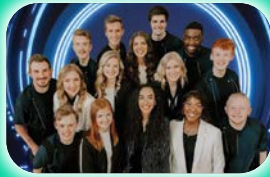
Voices of Lee